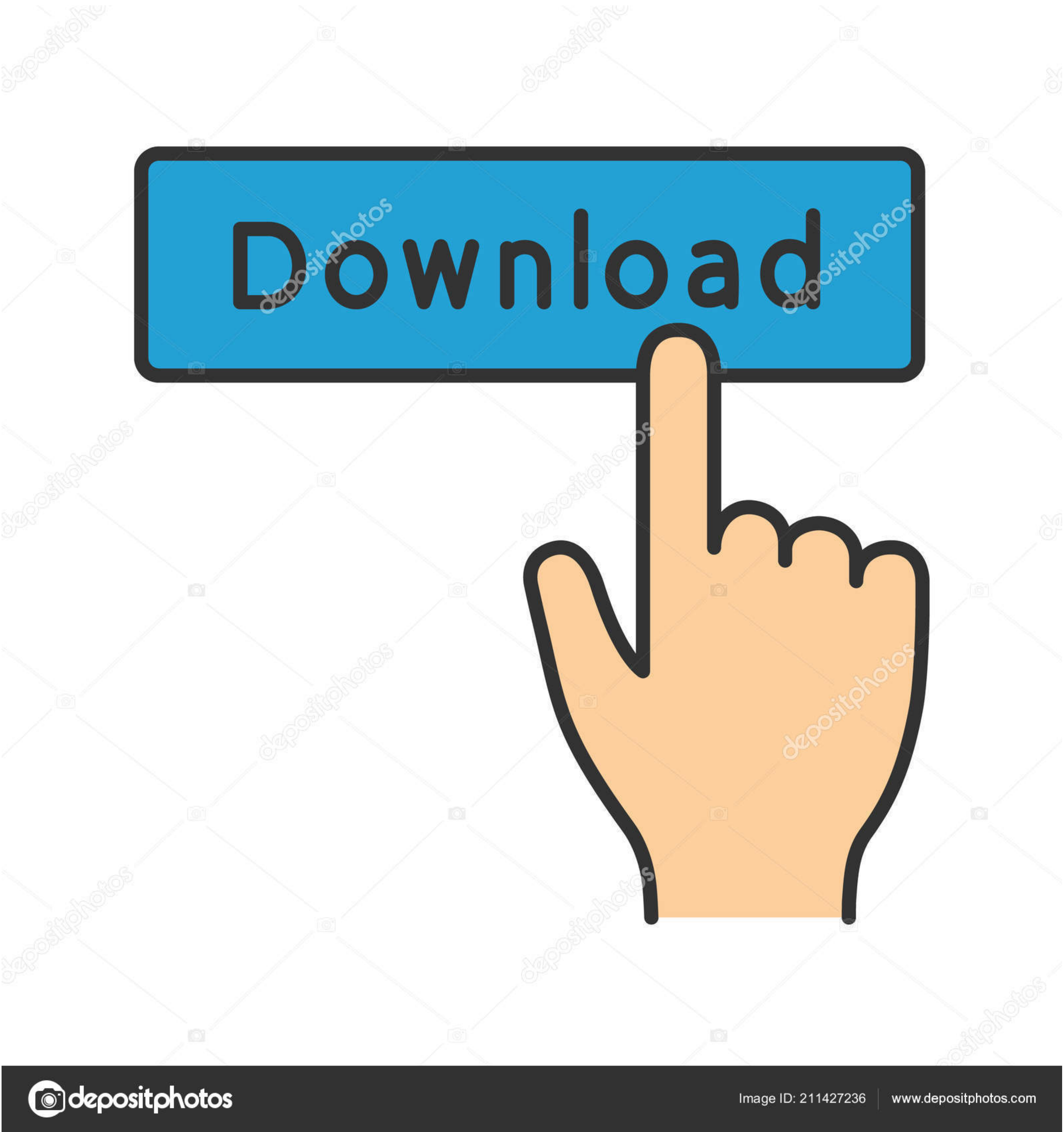
X Force Keygen Alias Surface 2019 Download