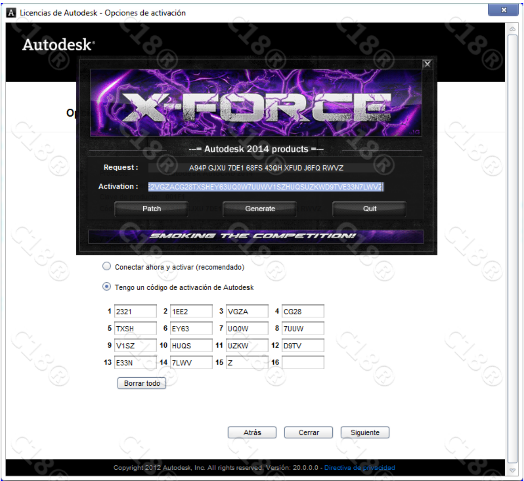
X Force Keygen Alias Surface 2019 Download